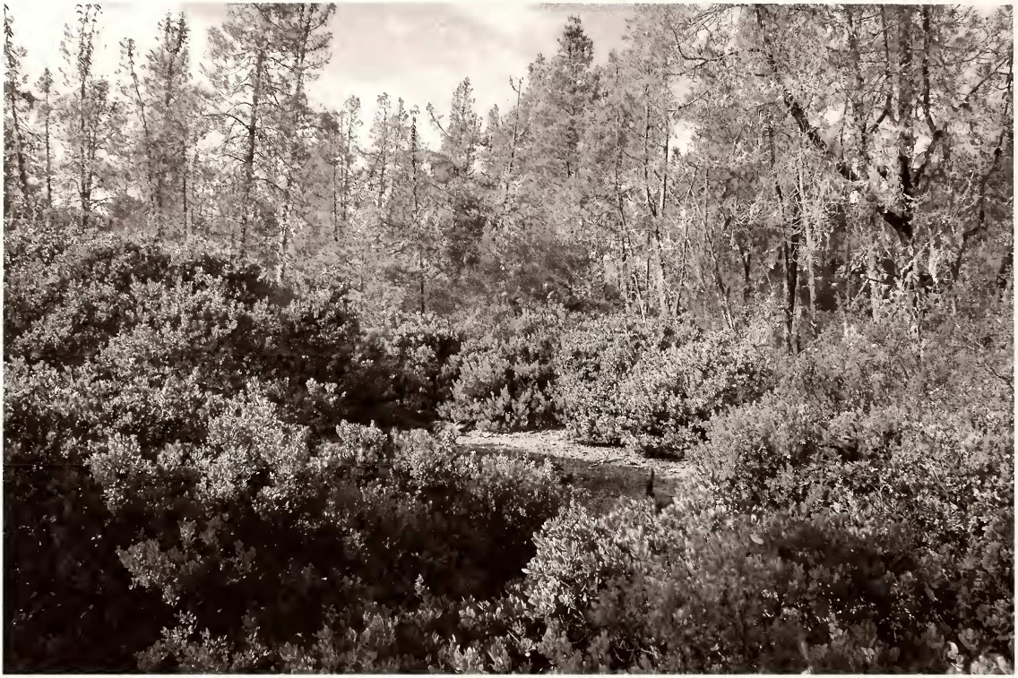
FIG. 2. Habitat of Arctostaphylos ohloneana on siliceous-shales substrates in knobcone pine – maritime chaparral assemblage. Four other species of Arctostaphylos dominate this shrub matrix including A. crustacea subsp. crinita , A. sensitiva , A. glutinosa , and A. andersonii .

interior in the Diablo Range, and north into the North Coast Ranges, considerably distant from the A. ohloneana population. Further, molecular analysis demonstrates that A. ohloneana has a distinctive ITS sequence that puts it in the smaller of two ITS clades (Boykin et al. 2005; Wahlert 2005). We are still investigating candidate species that are likely to be the closest living relatives to A. ohloneana , but our preliminary view is that A. ohloneana most likely represents a paleoendemic species that has been able to persist in the nutrient-poor Monterey shale barrens of northern Ben Lomond Mountain.